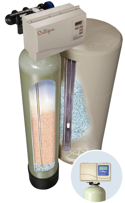
Culligan Medallist Series® outdoor model shown